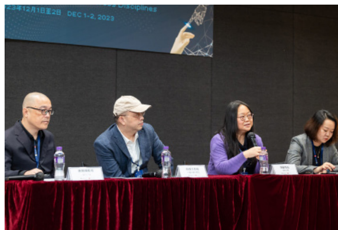
The first panel discussion: Global Artificial Intelligence Governance (I)

The Annual Conference was a signature event of IAS, providing a platform for scholarly exchanges and dialogues, as well as probing emerging research frontiers and broadening international perspectives. In the future, IAS will keep up with the latest research trends and organize more quality academic activities.