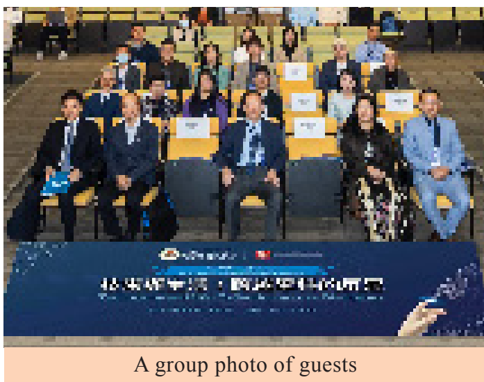
A group photo of guests

Theme: Technology and Life: Interdisciplinary Reflections