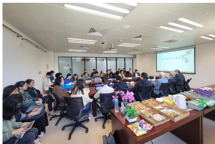
A group photo