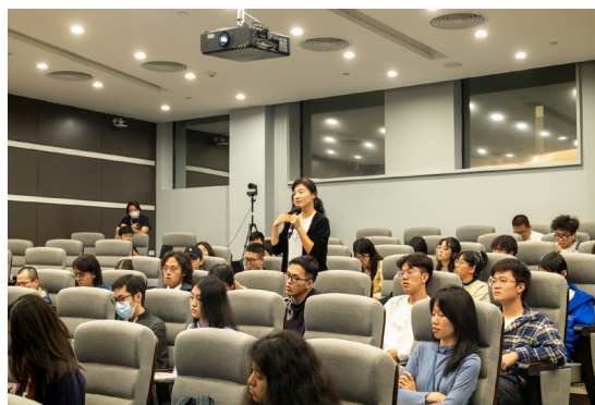
The Q&A and discussion session