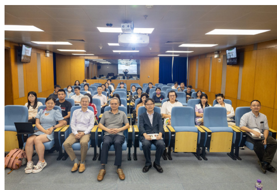
A group photo of guests and audiences