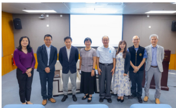
A group photo of speaker and faculty members