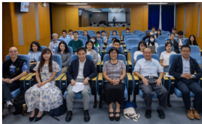
A group photo of guests and audiences

The lecture attracted over 100 participants, including teachers and students from various fields and disciplines both from within and outside the university, who actively engaged in a lively discussion on the issue of structural inequalities in American society.