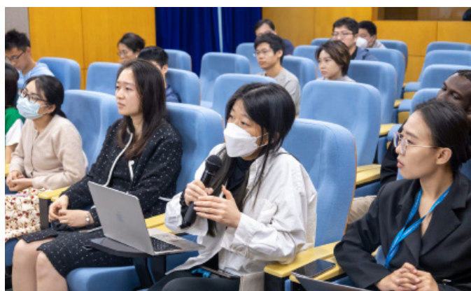
The Q&A session